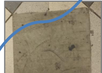
Tile replaced with filling material