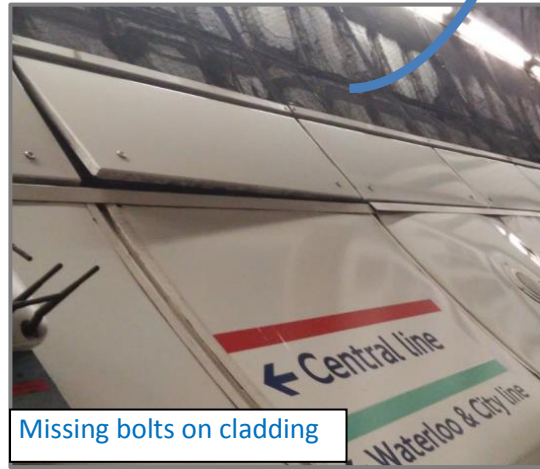
Missing bolts on cladding