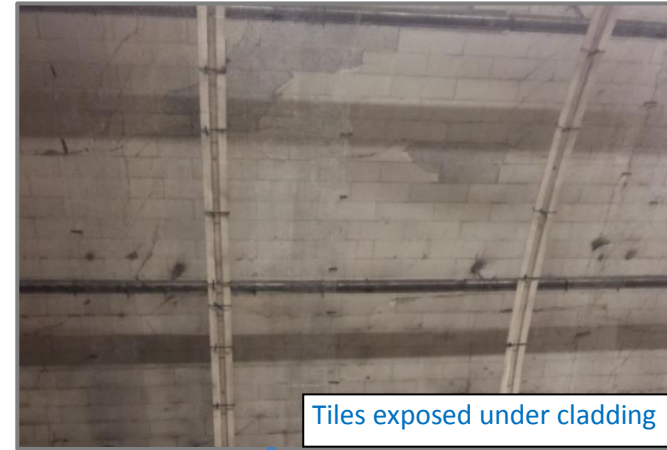
Tiles exposed under cladding