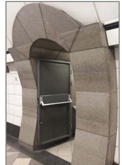
Opening cladding, sealed with flexible mastic – All cross passages