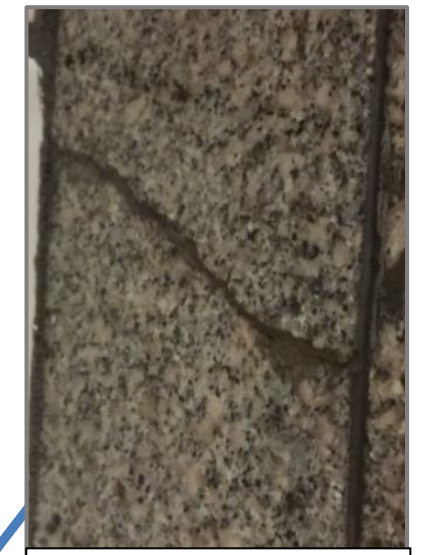
Tiles cracked in the vertical wall of the opening