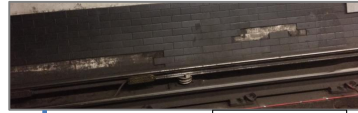
Tiles missing locally