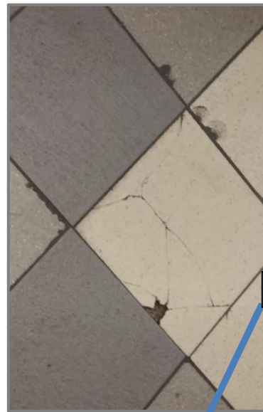
Tiles cracked/broken at the floor