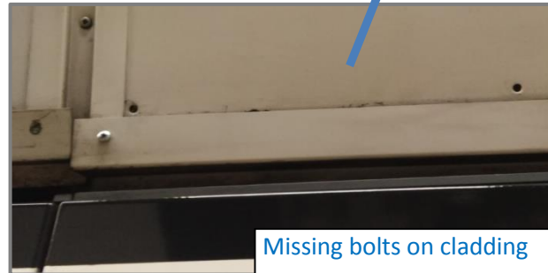
Missing bolts on cladding