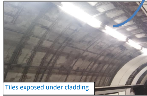
Tiles exposed under cladding