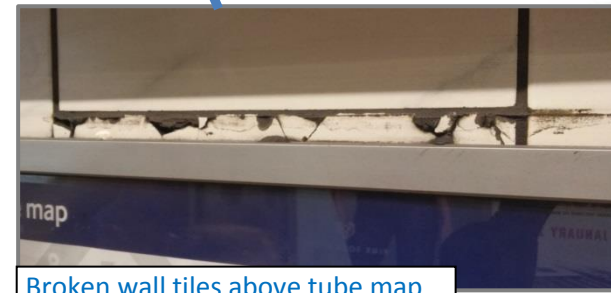
Broken wall tiles above tube map