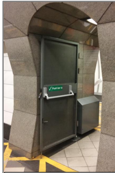
Potential trip hazard ??