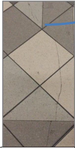
Cracked floor tiles