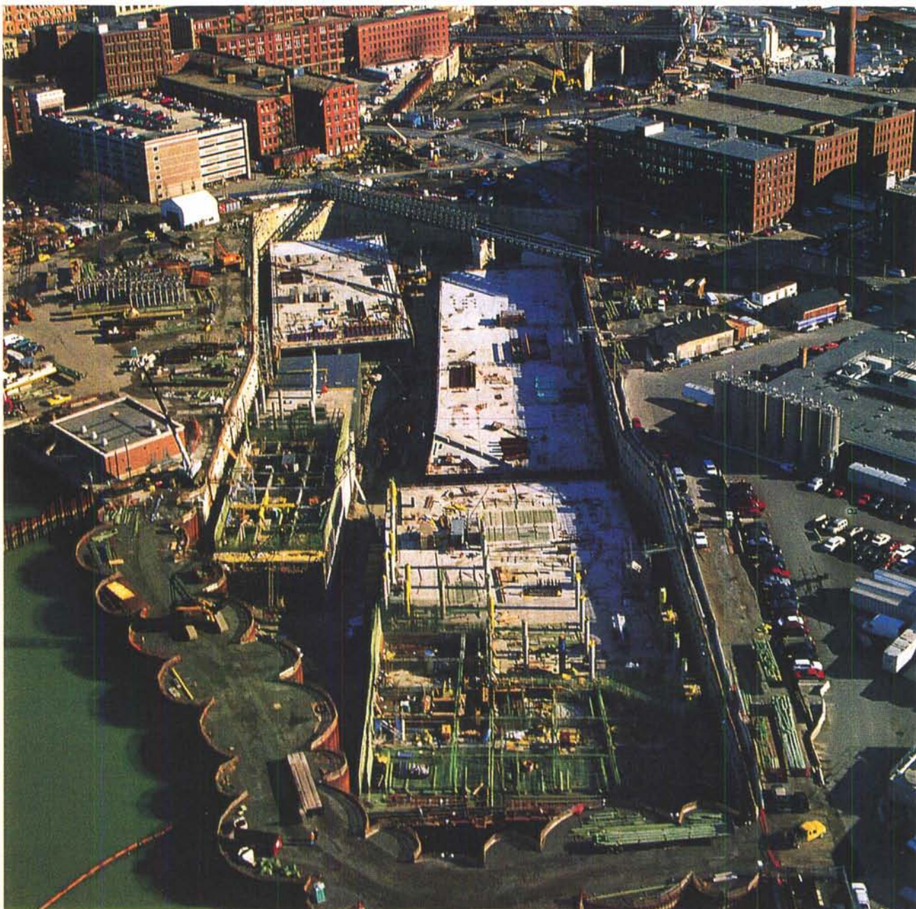
Photo 1. A giant cofferdam in Fort Point Channel creates a casting basin for the approximately 450-ft long immersed tunnel tubes.