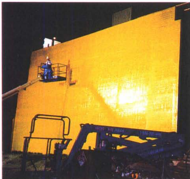
Photo 2. The first layer of spray-applied polyurea is colored brilliant yellow so that it will show through if the top gray layer is damaged.

pressway will be constructed. At the same time, the Massachusetts Turnpike (I-90) will be extended to Logan International Airport, serving as the final link in the interstate highway system that stretches from Seattle. In the end, 161 lane miles will be constructed in a 7.5-mile area.