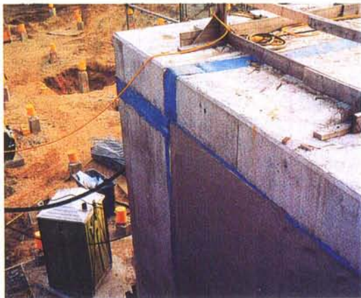
Photo 3. Blue PVC waterstops are installed at 20-ft intervals, forming a grid pattern.

To comply with Big Dig specifications, geotextile reinforcement must be used at all ITT construction joints and at the interface with the bottom steel plate. A nonwoven polyester, supplied by Precision Custom Coatings, Totowa, N.J., is being used for this purpose. First the waterproofing contractor sprays a quick pass of polyurea to build a 10-mil layer. Installers push the nonwoven into the polyurea while the membrane is still wet. Then the first 50-mil